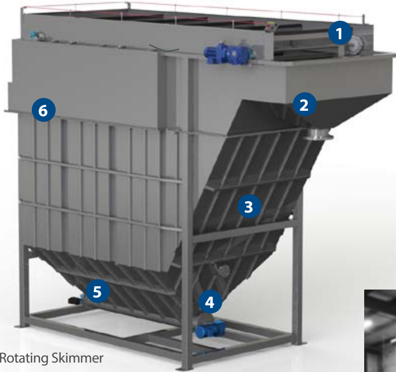
CPI with Rotating Skimmer