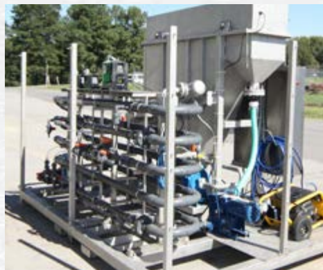
PCL RENTAL DAF