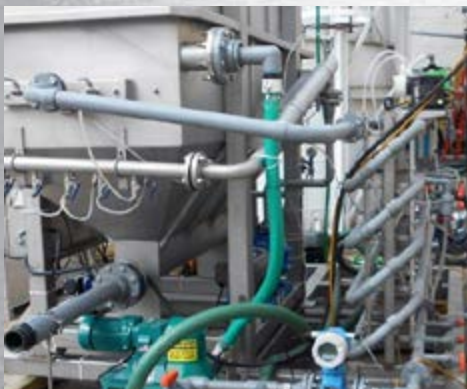
PWL RENTAL DAF

Rental units come with everything required to properly connect and control the DAF system including a feed pump, a flocculator, chemical dosing pumps, controls and much more. JWC Environmental will work with you to make sure your rental is outfitted for your unique needs.