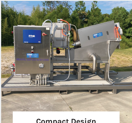
Compact Design SPACE-SAVING FOOTPRINT