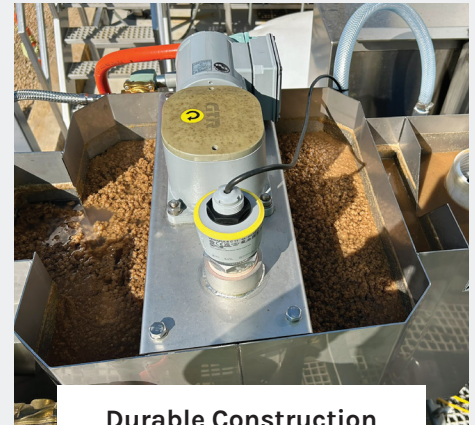
Durable Construction HIGH-QUALITY MATERIALS