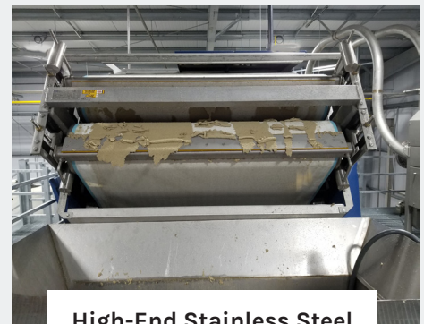
High-End Stainless Steel MATERIALS OF CONSTRUCTION