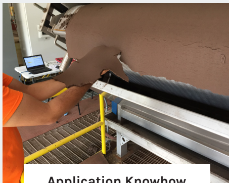
Application Knowhow CUSTOM SOLUTIONS