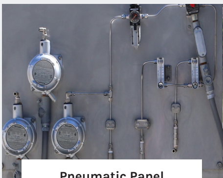
Pneumatic Panel IMPROVED AIR CONTROL